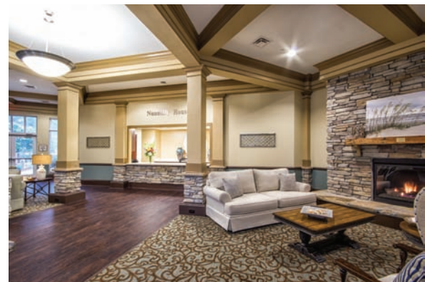
Comforting gathering spaces.