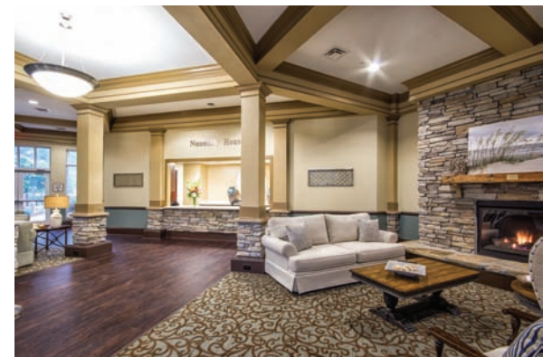
Comforting gathering spaces.